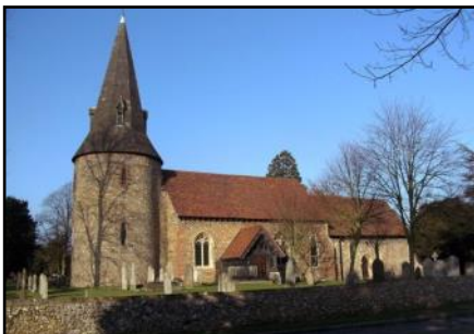
St Mary with St Leonard, Broomfield