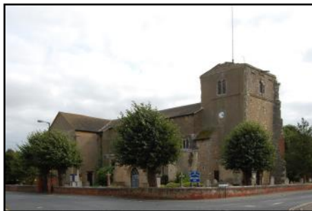
St Leonard, Southminster

In contrast there are only four churches in Essex dedicated to St. Leonard with Colchester having two, the others being St. Leonard's in Southminster and St. Mary with St. Leonard in Broomfield, Chelmsford. Leonard died in the year AD559 and as well as being the patron saint of prisoners, he also the patron saint of: locksmiths, horses, coopers, blacksmiths, coal miners, grocers and farmers amongst numerous others. If you ever enter a quiz and a question comes up regarding the patron saint of something obscure, then St. Leonard is always a good guess!