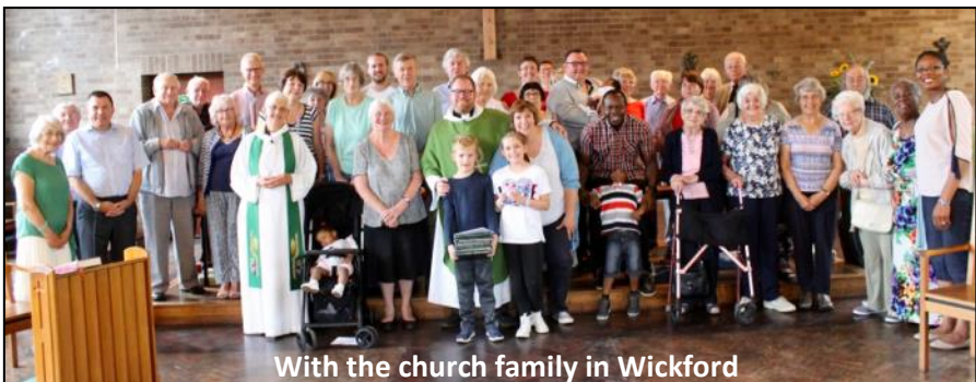
With the church family in Wickford