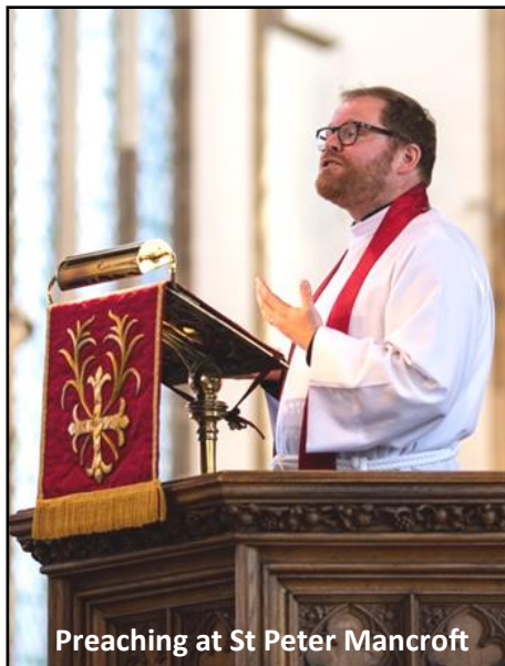
Preaching at St Peter Mancroft