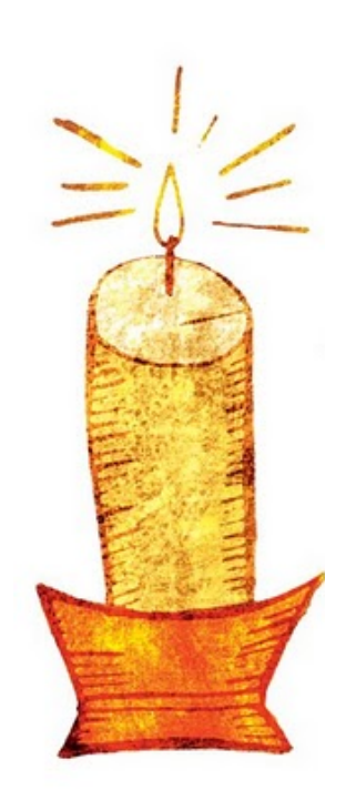
"to bring light to all nations"