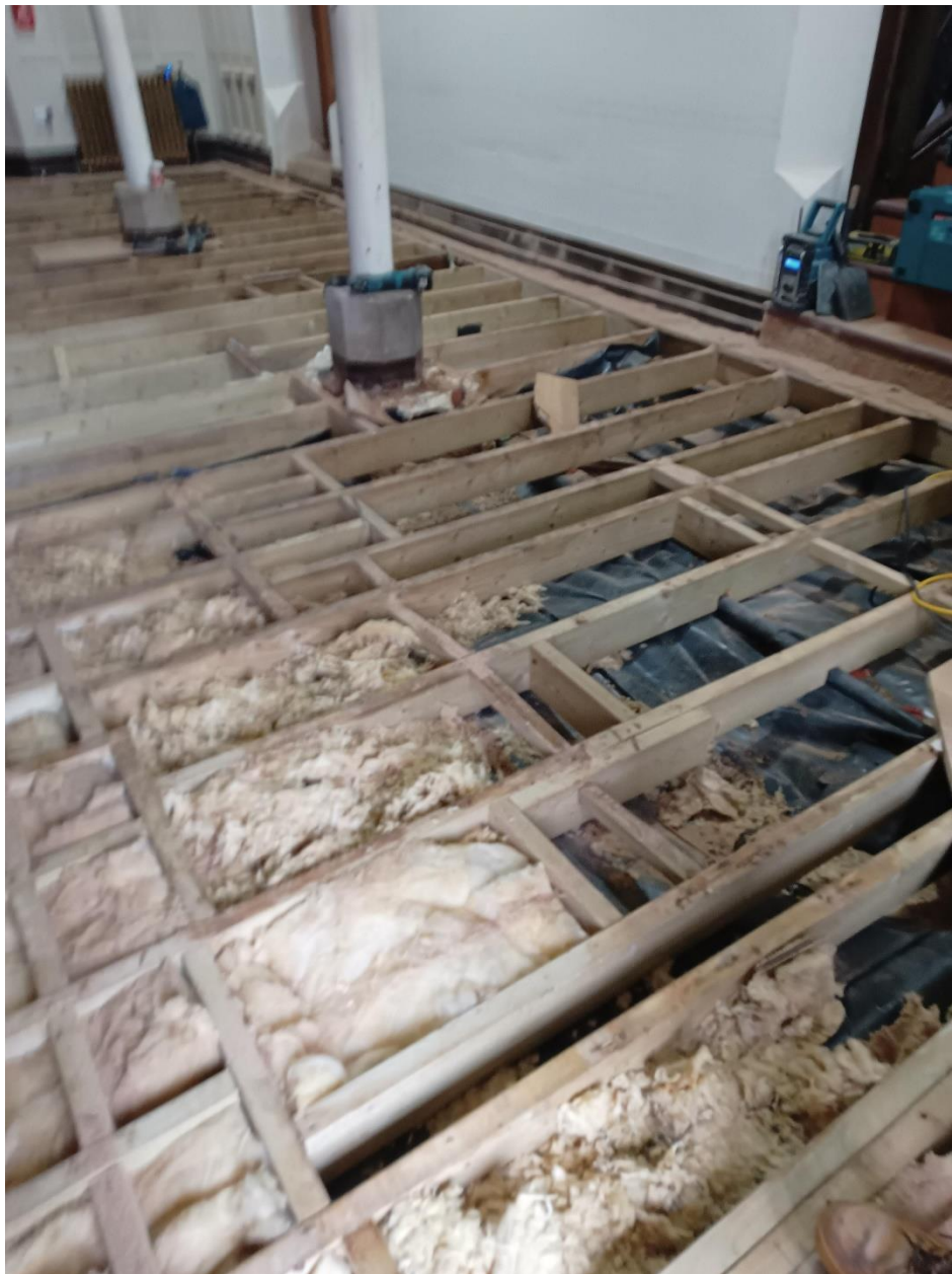
View of the Work at Rear of Church

There is still much to do, and we will be looking for help to carry out some the areas raised in the Quinquennial report. This includes re-staining much of the woodwork and some painting jobs. There are larger jobs to do but these involve scaffolding and need qualified technicians.